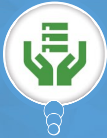
Point in Time Data Recover Flexible Options