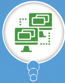
On-Demand & Archive Backups